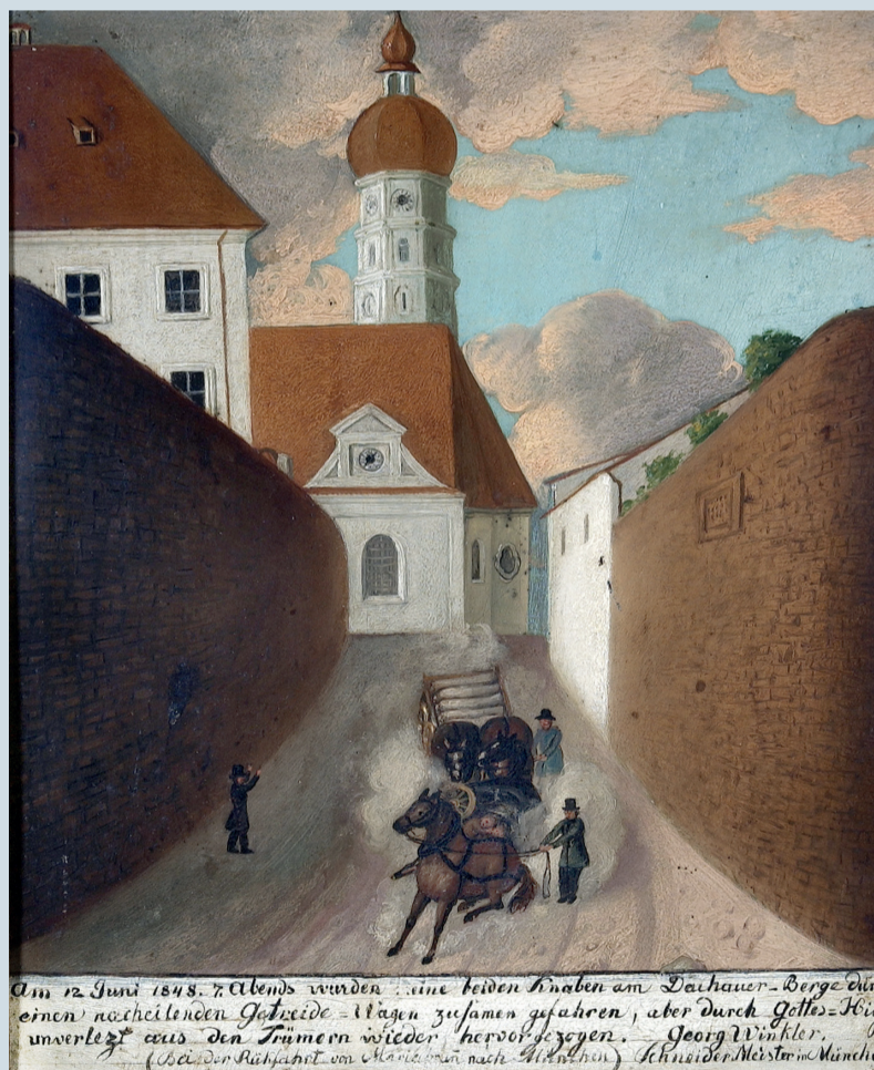
Even after modification, the road down the hill remained dangerous: On 12 June 1848, my two boys were hit on Dachau hill by a corn wain rapidly following behind, but with God’s help they were pulled from the wreckage uninjured... , votive tablet at the pilgrimage chapel of Maria-brunn (near Röhrmoos)